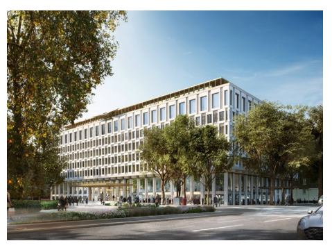
Above: Real PM is providing, programme, construction and procurement strategic advice on 30 Grosvenor Square. A highly technical scheme, where innovative temporary work sequences were adopted and considered within the programme.

Above: Real PM is providing Programme Management services on 120 Fleet Street. Providing detailed programming and logistics schemes at each design stage. Reviewing contractors' programmes during the multiple procurement phases. Liaising with the City of London and TFL to ensure the most efficient logistics scheme.